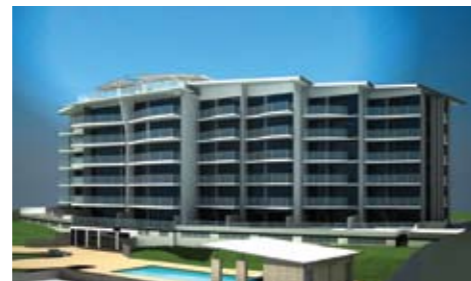
View from Charleston Esplanade