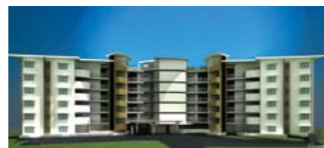
View from Watson Street